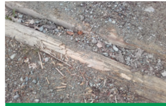
Wooden culverts cleaned one month ago

The vinyl open-top culverts are covered with the GlideWax® shield using specially selected metal oxide nanoparticles, to enhance the hydrophobic properties of the profile surface. Thanks to the GlideWax® shield the open-top culverts clean themselves of sand, small stones and other material carried by the rainwater or vehicles wheels.