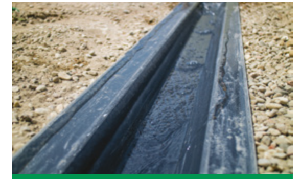
Vinyl culvert covered with GlideWax® shield